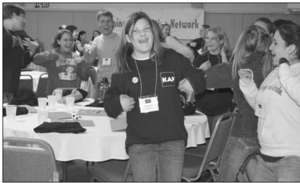
The youth had a great time while learning about ways they can make a difference in the fight against tobacco.

The Second Annual Maine Youth Anti-Tobacco Summit was held this past April 13th and 14th in Bar Harbor. Sponsored by PTM, the event united approximately 100 youth from grades 8-12 together from all over Maine to rally against Big Tobacco, educate one another on basic tobacco issues, and discuss ways to prevent youth tobacco use. The Youth Planning Team, led by Ellsworth High School's Student Health Awareness Group (SHAG), decided to continue last year's successful theme, Stop. Quit. Resist!