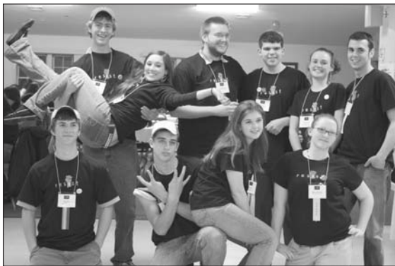
Youth Summit Planning Team